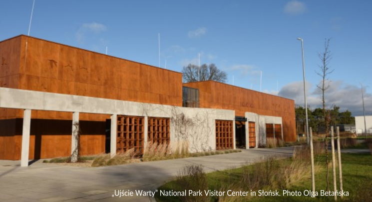
„Ujście Warty” National Park Visitor Center in Słońsk.