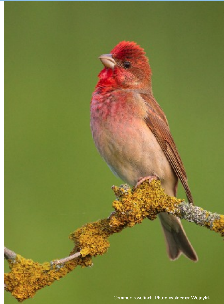
Common rosefinch.